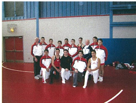
Exhibition by Temple Men's Gymnastics team (One session only)