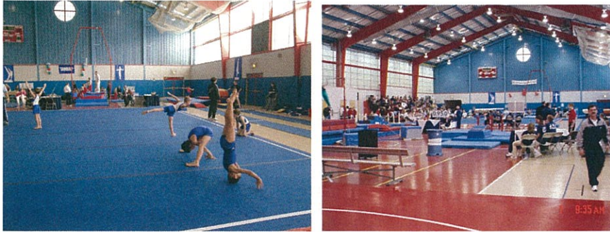
Spacious competition area and excellent viewing conditions

At the John Pancott Invitational Boys Meet....You can count on the following: